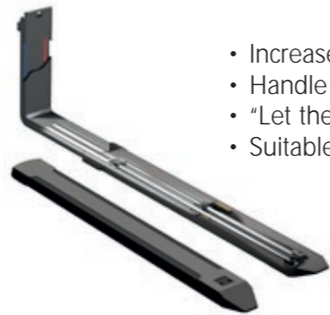
Hydraulic extension forks