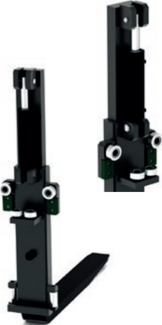
Height adjustment forks