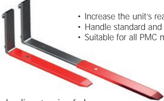
Manual extension forks